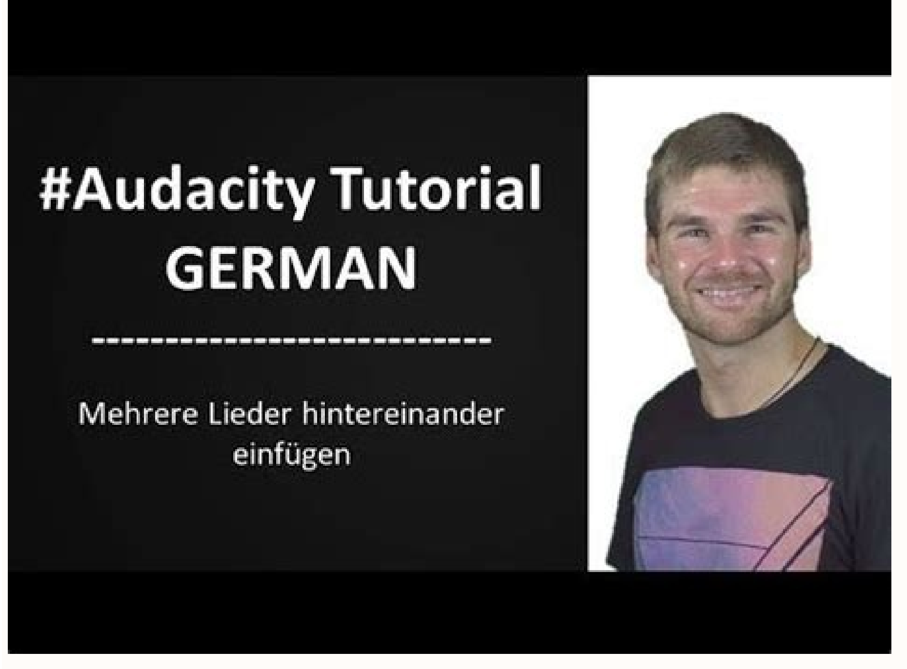
Audacity mac tutorial deutsch. Youtube audacity tutorial deutsch. Audacity mashup tutorial deutsch. Audacity tutorial deutsch download.